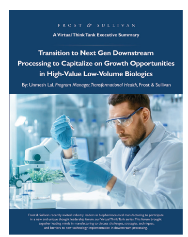
Transition to Next Gen Downstream Processing to Capitalize on Growth Opportunities in High-Value Low-Volume Biologics