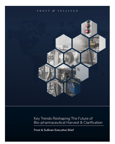
Key Trends Reshaping The Future of Bio-pharmaceutical Harvest and Clarification

See more white papers from Frost & Sullivan and stay connected with industry expert news. 3M will keep you up to speed on innovative material science technologies. Click on the link below to join our email subscription.