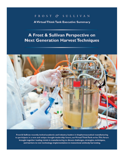
Perspective on Next Generation Harvest Techniques