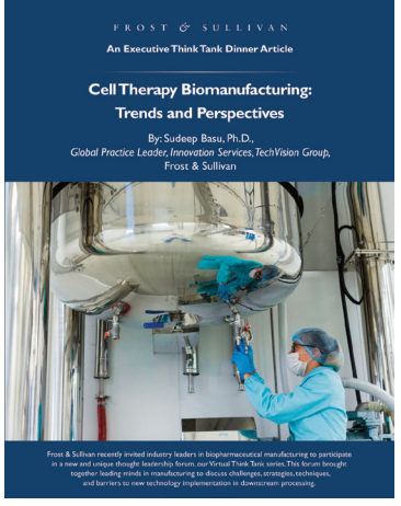
Cell Therapy Biomanufacturing: Trends and Perspectives