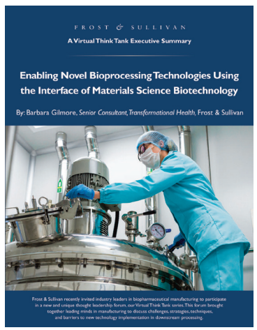
Enabling Novel Bioprocessing Technologies Using the Interface of Materials Science Biotechnology